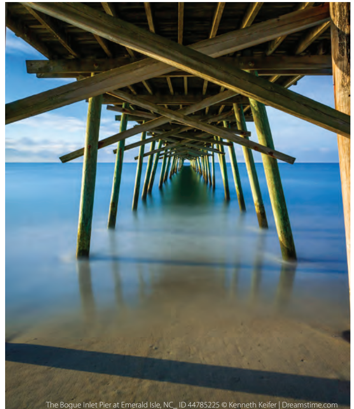
The Bogue Inlet Pier at Emerald Isle, NC_ID 44785225