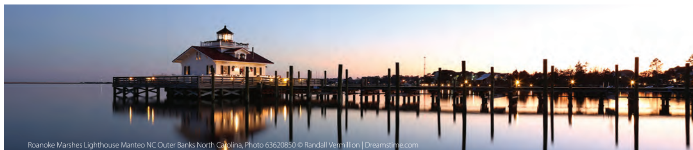
Roanoke Marshes Lighthouse Manteo NC Outer Banks North Carolina, Photo 63620850 © Randall Vermillion | Dreamstime.com