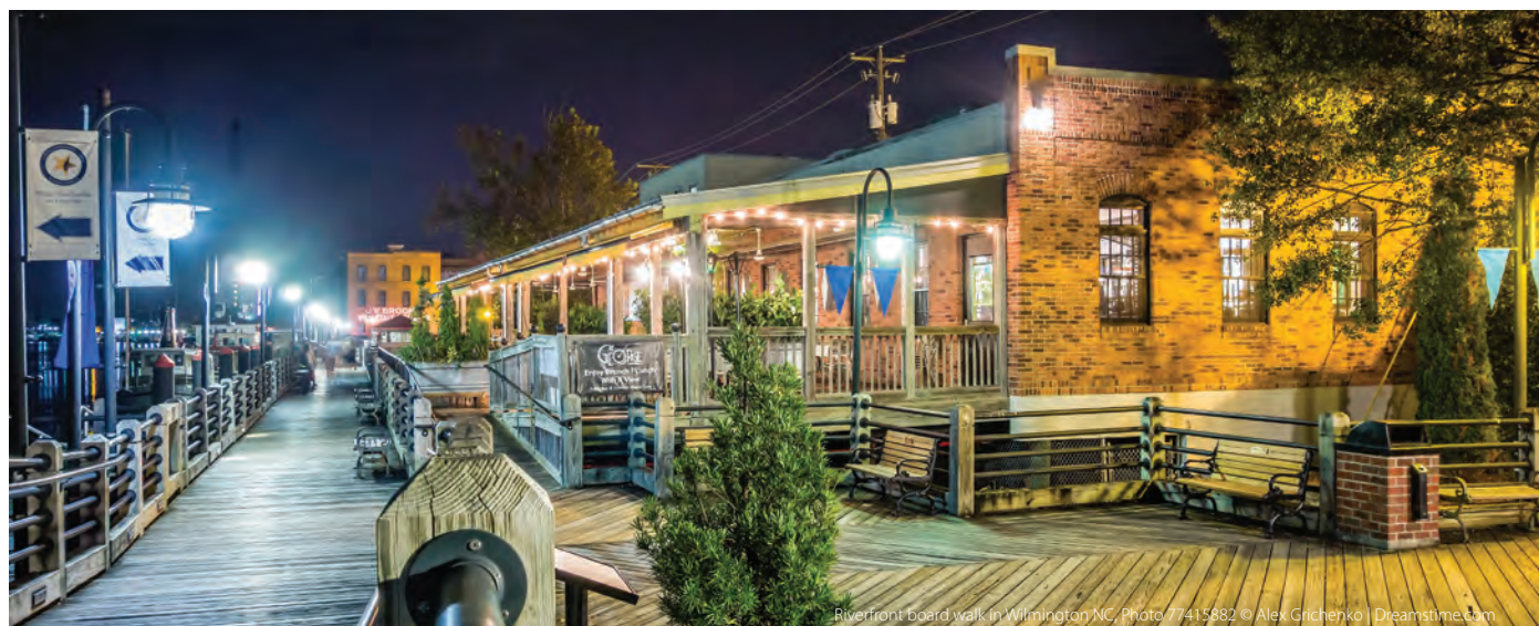
Riverfront board walk in Wilmington NC, Photo 77415882 © Alex Grichenko | Dreamstime.com