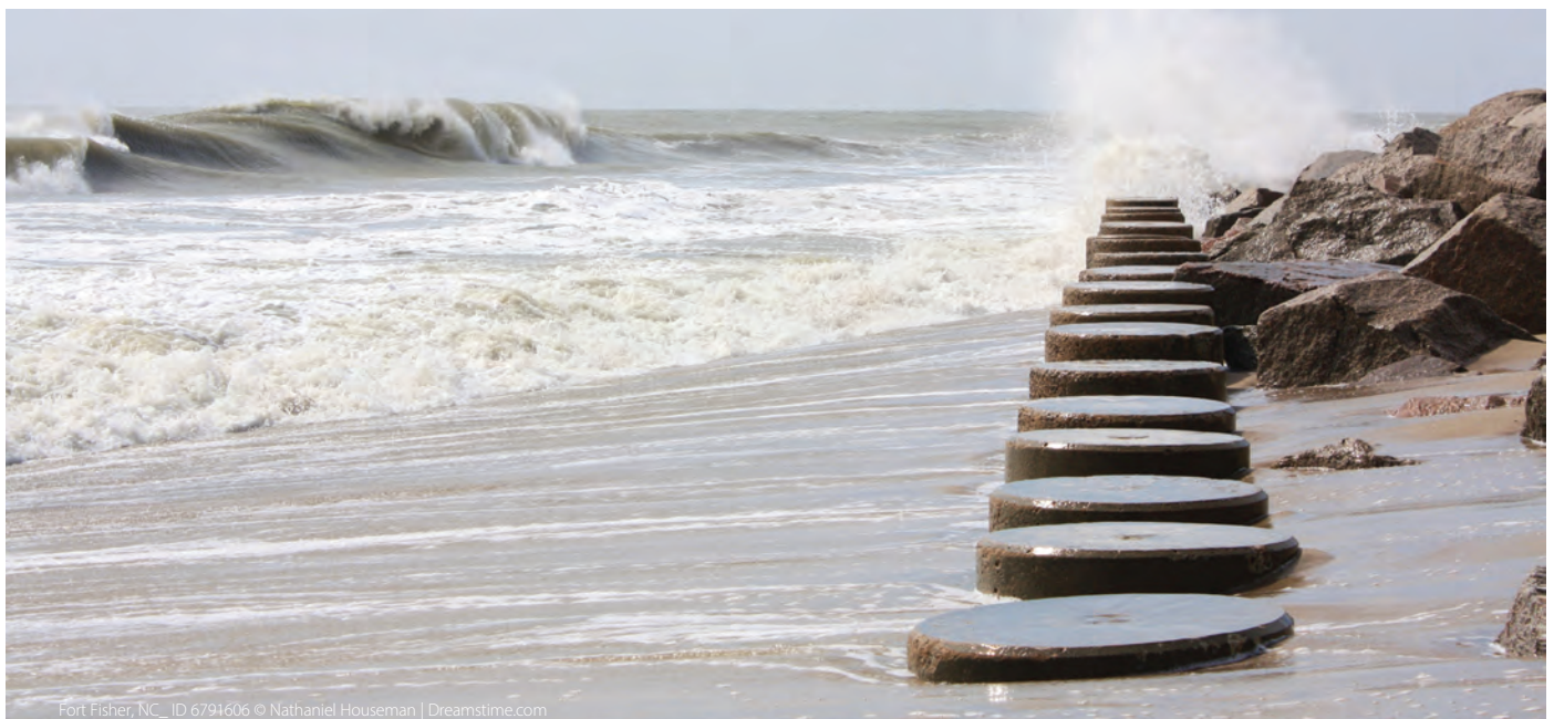
Fort Fisher, NC_ID 6791606

The portability feature allows continuation of critical illness coverage when employment ends or the policy terminates, by paying premiums directly to Voya Financial. Employees can contact Voya Benefits for more information at 1-877-464-5111 .