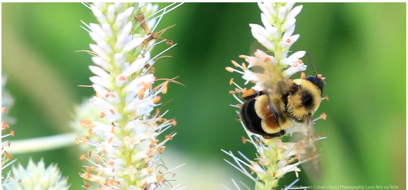
Bumble Bee on Culver's Root | Photography: Larry Reis via flickr

If an employee leaves employment or retires, portability of the Critical Illness Plan is available, if elected prior to the employee reaching age 70. For details and rates, employees may contact Voya at 1-877-464-5111 .