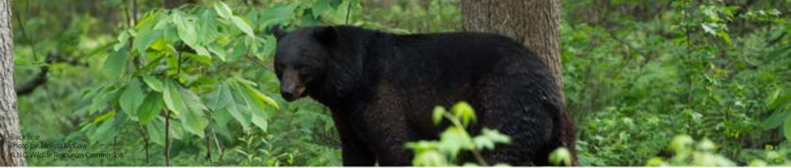
Black Bear