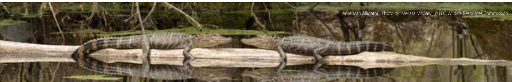
American Alligator

oshr.nc.gov/state-employee-resources/benefits/leave .