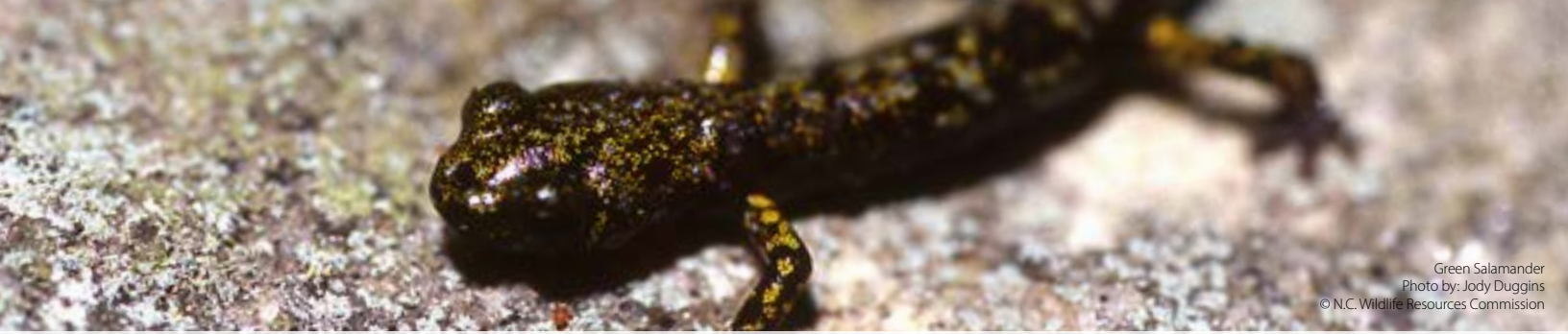
Green Salamander