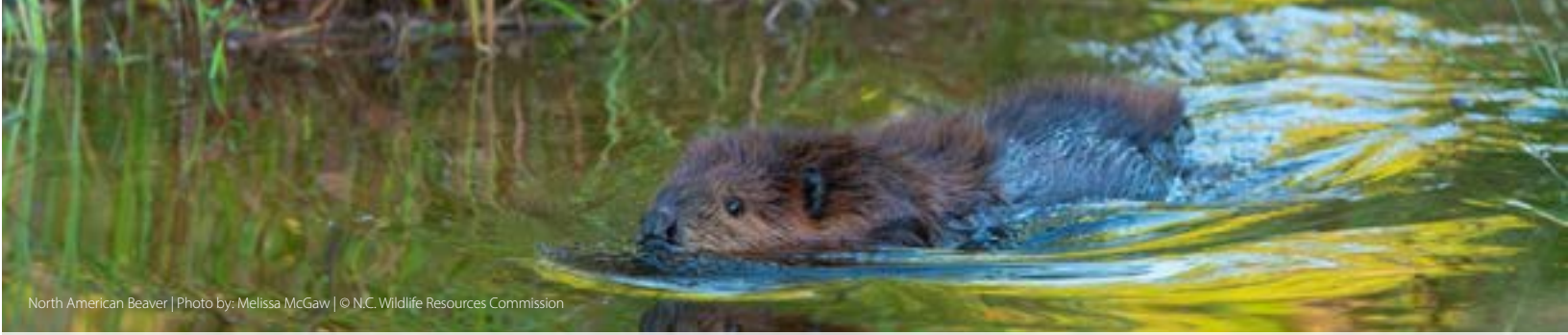
North American Beaver