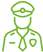
Officers in Adult Correction