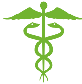
Nurses at DHHS