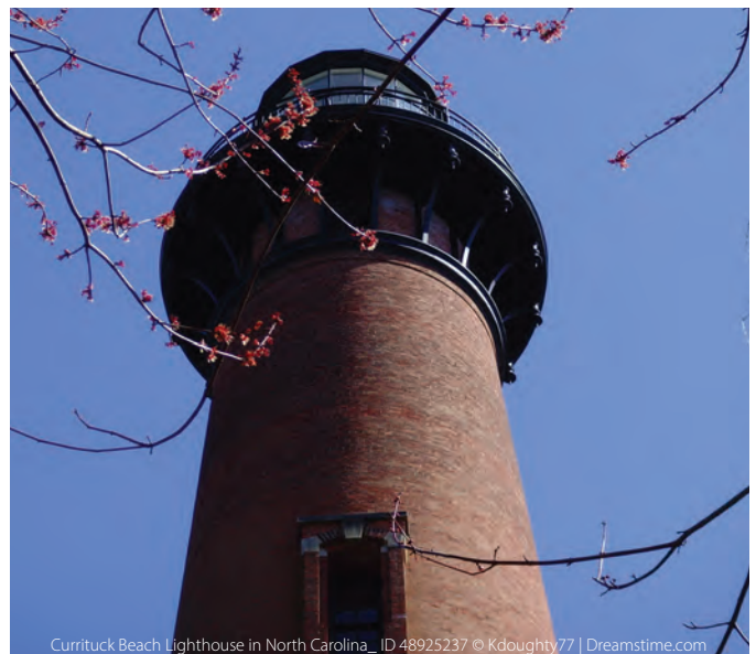
Currituck Beach Lighthouse in North Carolina_ID 48925237

State of NC employees who participate in the Teachers' and State Employees' Retirement System (TSERS) are provided with basic short-term disability (STD) and long-term disability (LTD) coverage at no cost. These basic STD and basic LTD benefits are provided under the Disability Income Plan of North Carolina (DIP-NC). See Disability Benefits for Participants in TSERS on page 47 for details. Employees also can purchase additional protection by enrolling in the Voluntary Disability Plan, described in this section, that may increase the amount of STD and LTD benefits they receive each month.