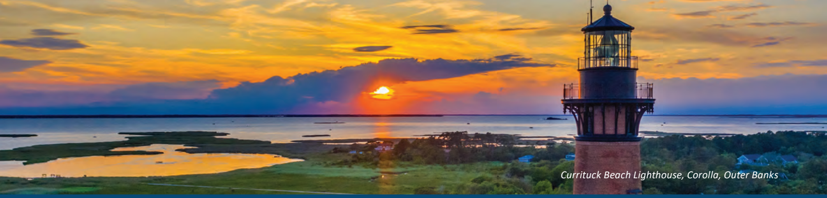
Currituck Beach Lighthouse, Corolla, Outer Banks