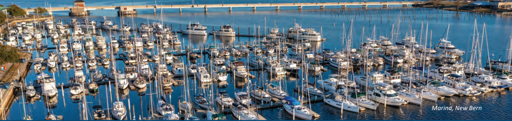
Marina, New Bern