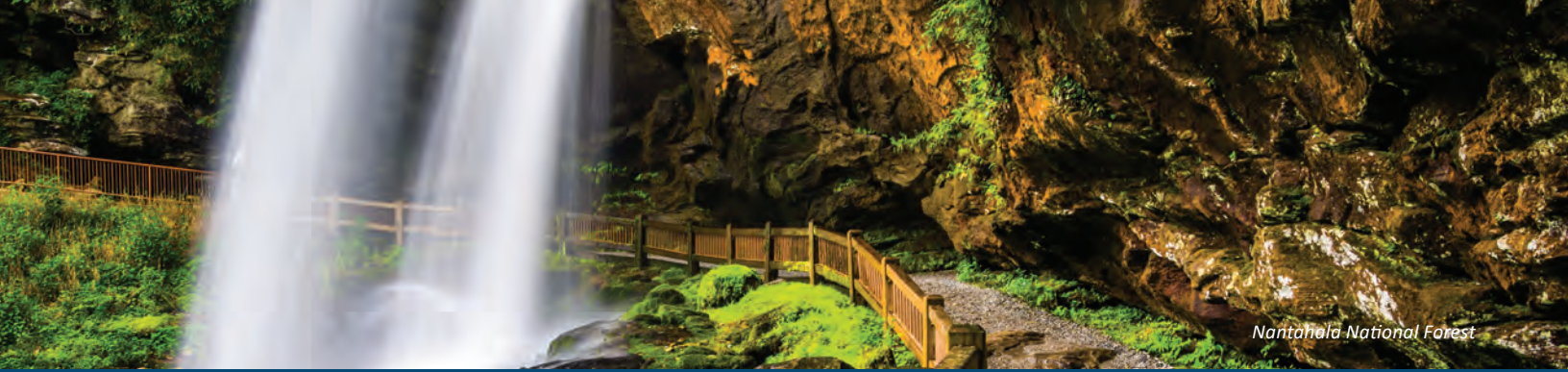
Nantahala National Forest