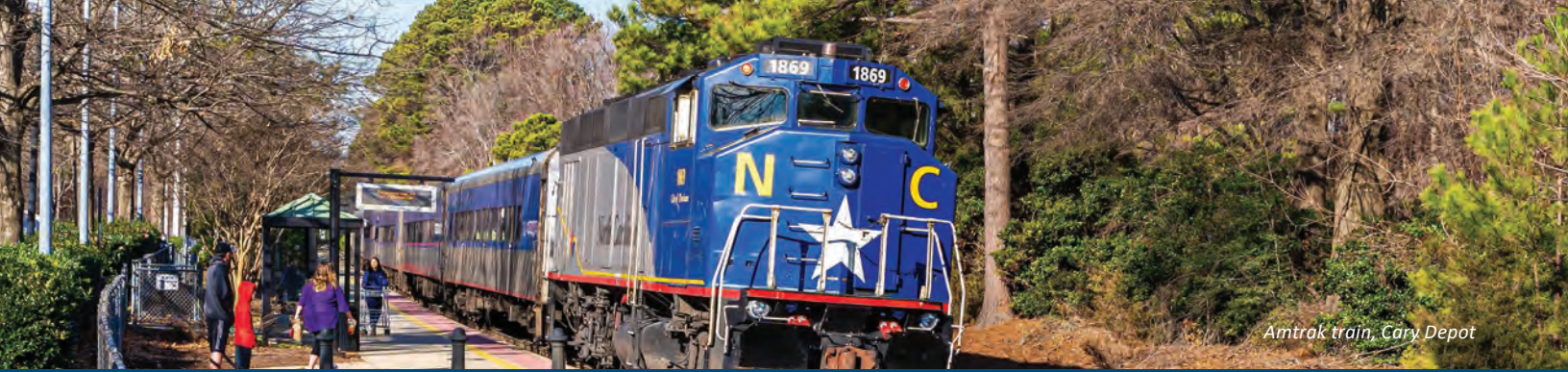
Amtrak train, Cary Depot