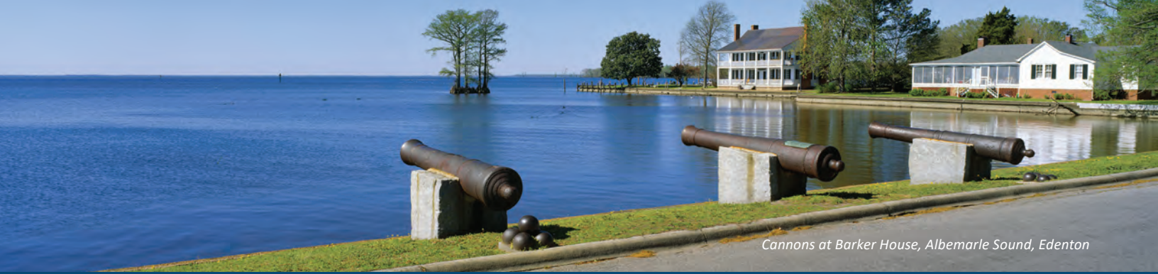
Cannons at Barker House, Albemarle Sound, Edenton