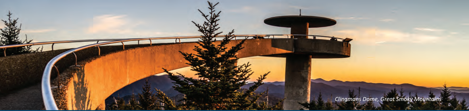
Clingmans Dome, Great Smoky Mountains