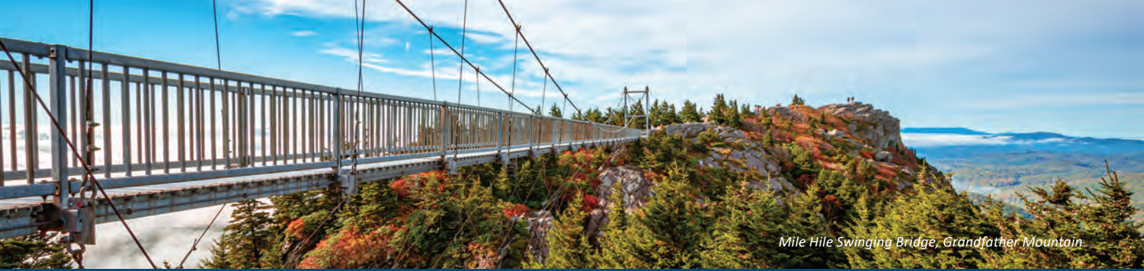
Mile Hike Swinging Bridge, Grandfather Mountain