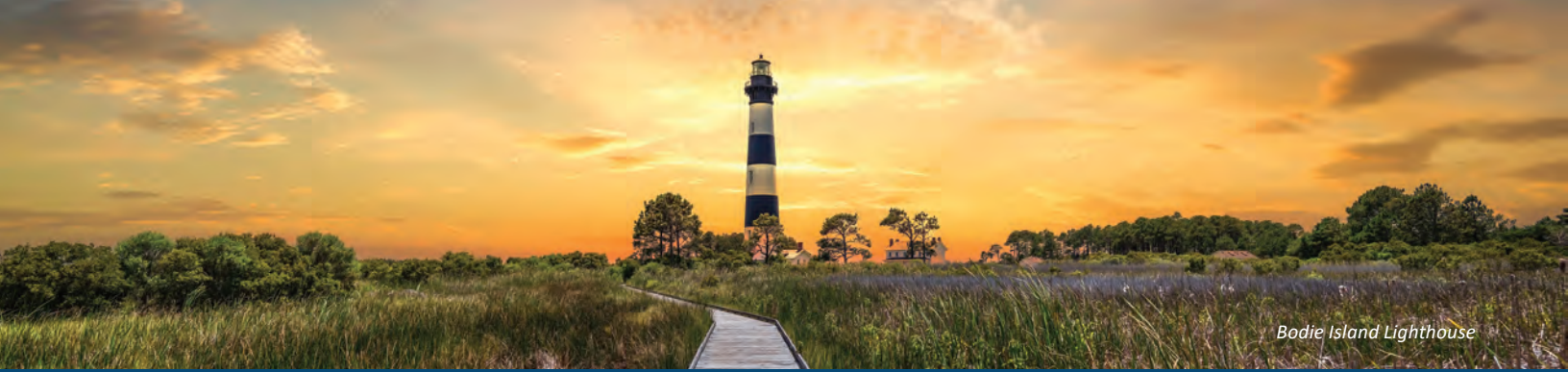
Bodie Island Lighthouse