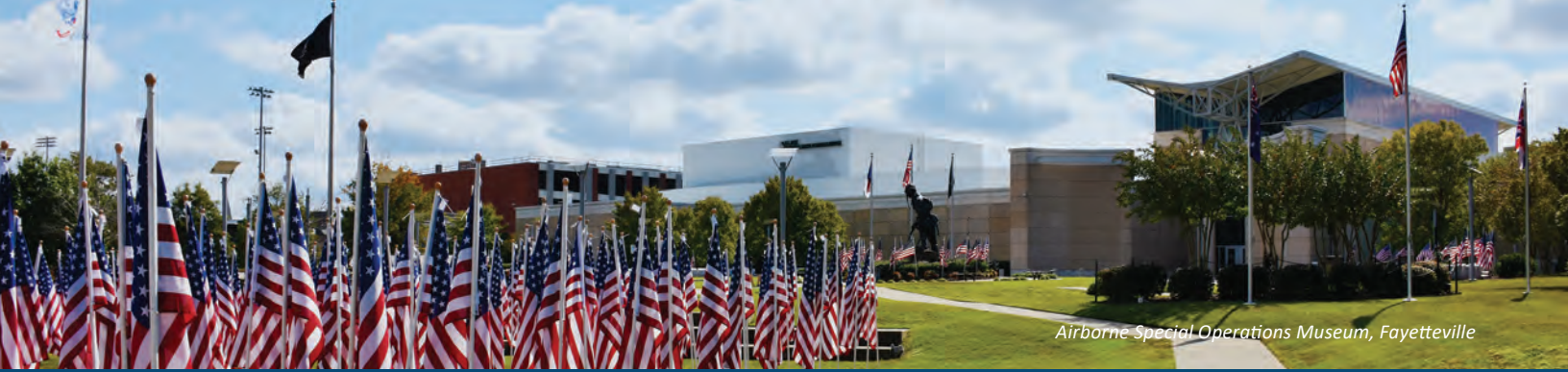
Airborne Special Operations Museum, Fayetteville