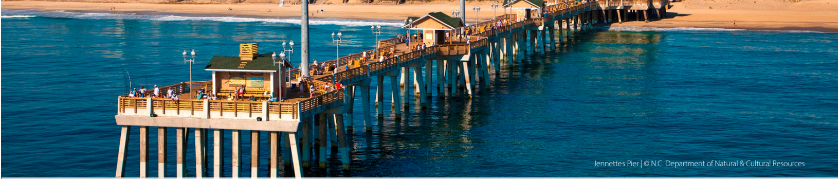
Jettettes Pier